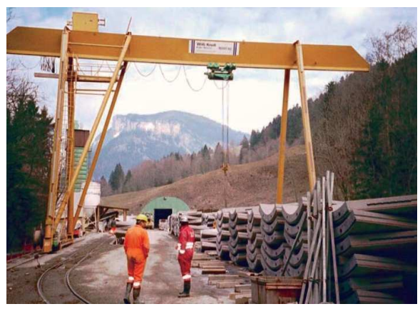
Stollen Sörenberg during construction