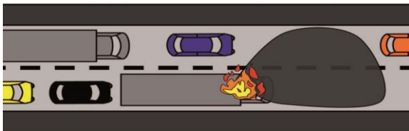
Fire Scenario in Uni-directional Traffic