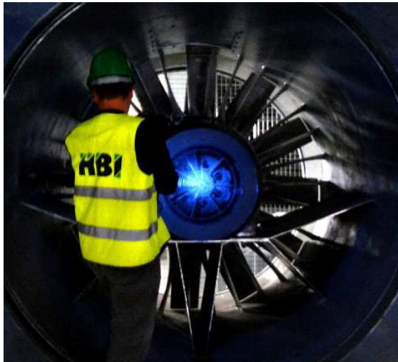
Main filtration fan: installation check