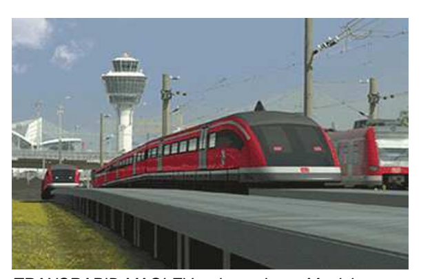
TRANSRAPID MAGLEV-train at airport Munich