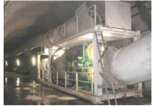
Refrigerator and air cooler

Calculated air temperatures according to excavation progress without cooling