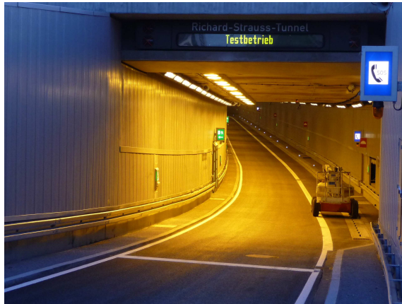
Entry portal Vogelweideplatz