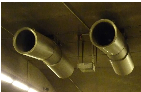
"Banana" jet fans at the exit to Vogelweideplatz