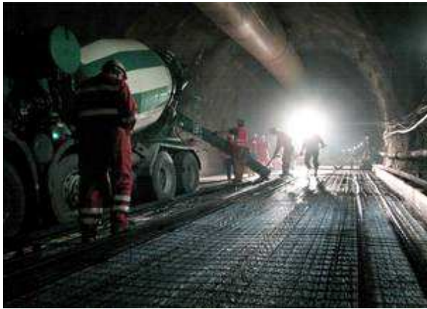
Construction of the trackway with preliminary ventilation