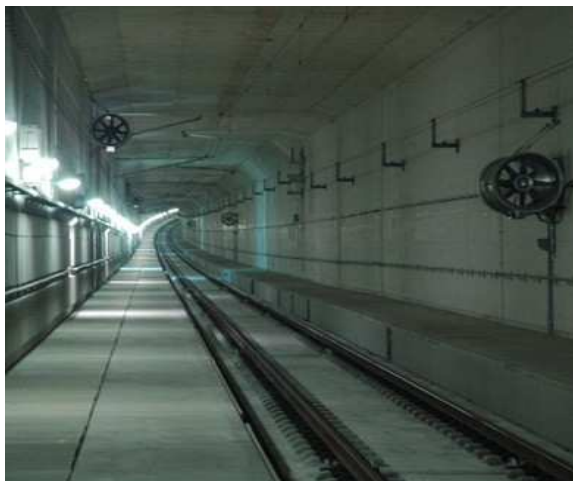
Tunnel Dordtsche Kil