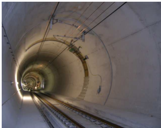
Single track tunnel: eastern tube